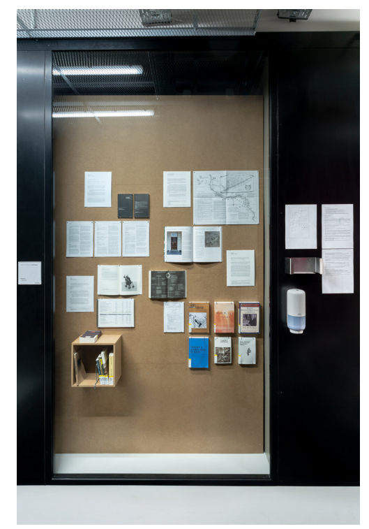
// Figure 1 Installation view Source Materials, 2022

Transcription from the recording of the talk: Rowland 2020.