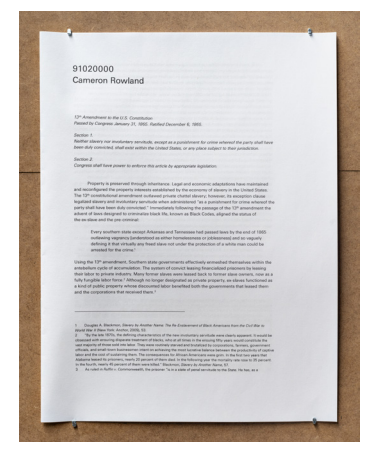
// Figure 4 Installation view (No. 1: Exhibition pamphlet for "91020000", 2016), Source Materials, 2022

11) For the full caption of the work Summer 3d One Stroller – Item: 6781-005030, 2018, see the Rowland 2019.