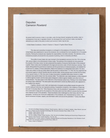
// Figure 5 Installation view (No. 4: Exhibition pamphlet for "Deputies", 2021), Source Materials, 2022