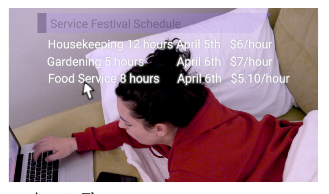
// Figure 1 Melanie Gilligan, Crowds , 2019

Crowds was presented in an exhibition as a video installation on top of the floorplan of a home. The screens scattered within the space are punctuated by household utilities such as a sink and a mobile bearing the cliche "LIVE LOVE LAUGH."