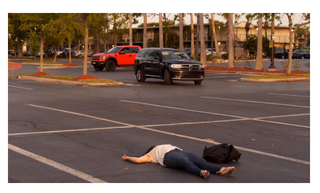
// Figure 3 Melanie Gilligan, Crowds , 2019

closes a car door. She then lies on the ground in a parking space, as if she were a car [fig. 3] . We are made aware of the difference in scale between a person and a city wholly designed for cars, a space that is, in the sense given by Guy Debord, unified and homogenized so that it is merely free space for commodities (Debord 1970: 165). Here, the person rotates through life by working enough to survive, unable to get out of such conditions.