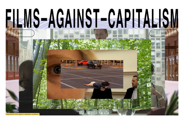
// Figure 7a & 7b Melanie Gilligan, Films Against Capitalism, 2022