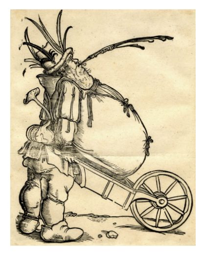
// Figure 4 Hans Weiditz, Winebag and Wheelbarrow, 1521 (circa)

"Im alter aber wirds mir schwer/ Wen mir mein grosser wamst steet leer/ Und ist alls durch den Ars gefaren/ Das muss ich waynen in alten Jaren."