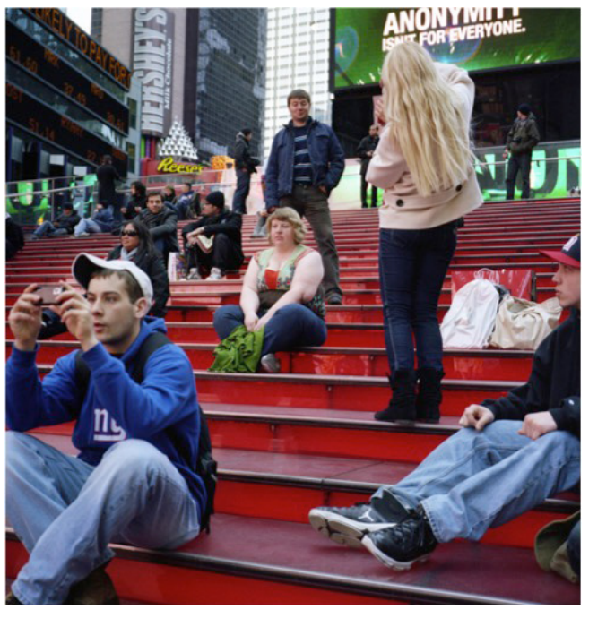
// Figure 1 Haley Morris-Cafiero, Anonymity Isn't For Everyone, 2010. Wait Watchers series. New York. NY

For the scope of this paper, discussion of the fields of fat studies and disability studies is primarily centered on research conducted in the U.S.