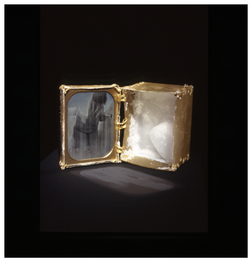
// Figure 2 Haley Morris-Cafiero, Shape to Fit series, 2003, daguerreotype, paraffin wax. and rawhide

the series Shape to Fit for her graduate thesis; this series analyzed her attempts to manipulate her body by losing weight in order to use a standard public bathroom and her inability to do so. She captured her efforts to fit within a space designated for all people by photographing herself over a ten-week period endeavoring to enter a public bathroom stall (fig. 2). She used a daguerreotype process for these self-portraits because of how the image is imbedded within the mirror-like surface of the polished-silver plate, speaking to both the physicality of her weight and the narcissistic-connotation that is implied in the reflective surface. These daguerreotypes were placed on