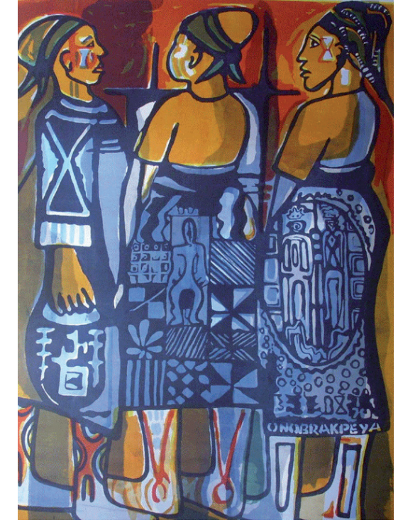
// Figure 04 Bruce Onobrakpeya, Untitled, 1959, painting.

Bruce Onobrakpeya in conversation with the author, April 18, 2014.