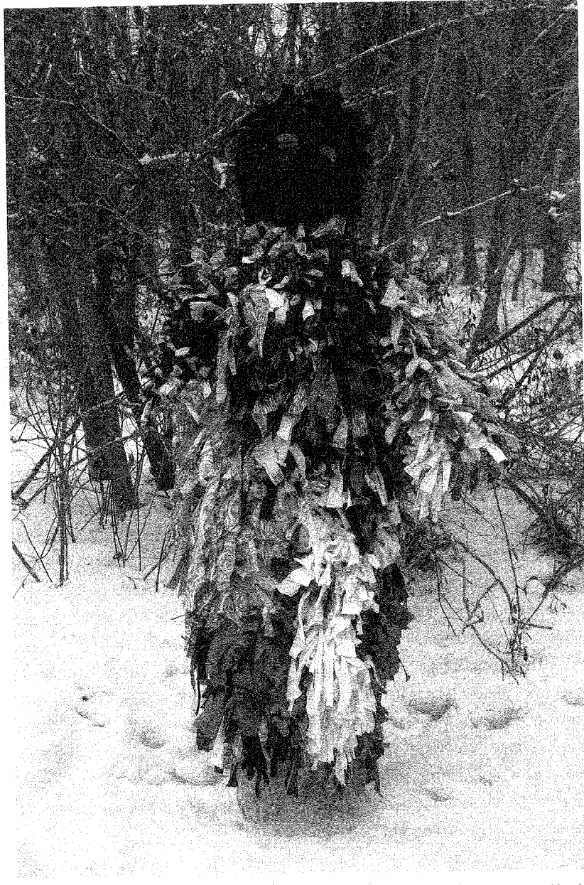
Agnes Achola, Leftover, 2010, wire mesh and textiles, 150 cm, exhibited during the project and book presentation at Secession, Vienna

and the western domination of and threat to local markets, for example in Uganda. Thus the European textile leftovers, which are exported to be re-used in Africa increasingly drive out the traditional clothing producers and have a long-term damaging effect on whole industries. This continuation of colonial rule and exploitation relationships expresses itself both in Africa and Europe in view of tightened border regime and asylum policy.