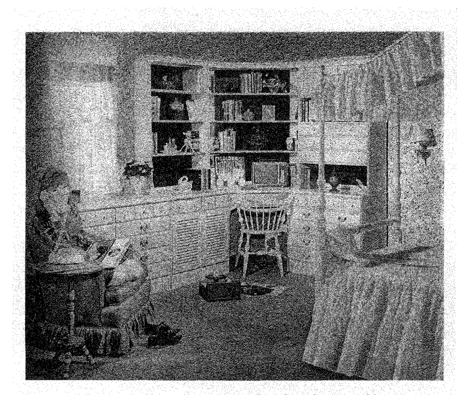
Create a neat, charming room with a place for everything.

Another difficulty is the question of agency, as parents control many aspects of the decorating process, while also often controlling how their decorating choices are re-